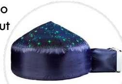
Starry Night (Glow)